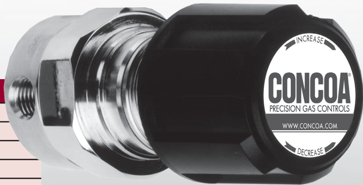
426 3001-000 shown